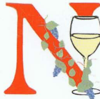
Nebraska Winery & Grape Growers Association