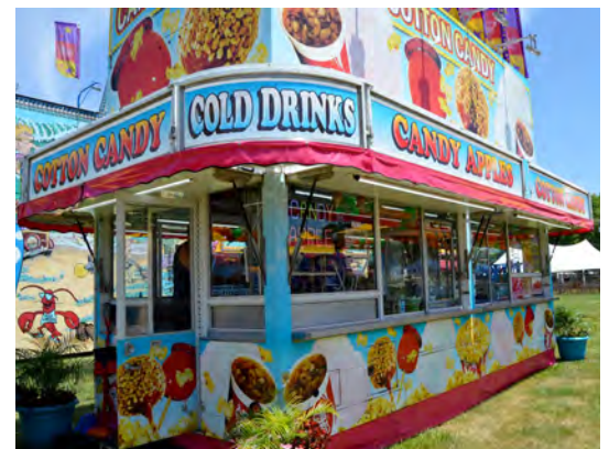
Carnival food stands are popular at town festivals.

There are also hundreds of smaller festivals in Nebraska that are enjoyed by local residents. Examples include Limestone Days in Weeping Water and Papillion Days in Papillion. There tends to be many first-time vendors and volunteers working at the