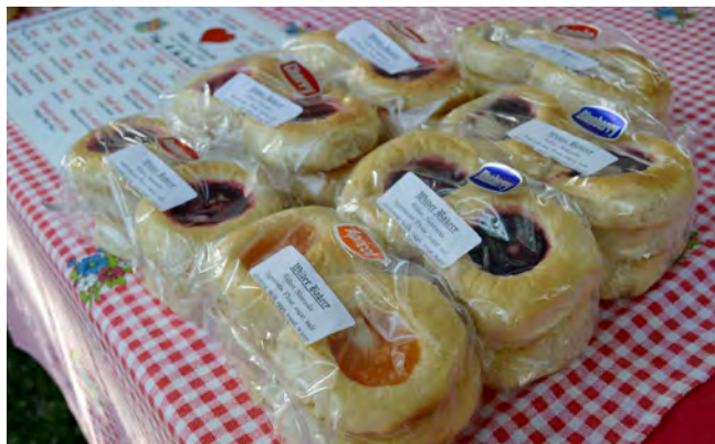
Baked foods are a favorite at special events.